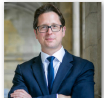
Alex Burghart Parliamentary Under Secretary of State (Minister for Skills)