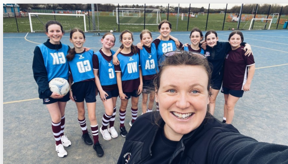
Year 7 girls netball team