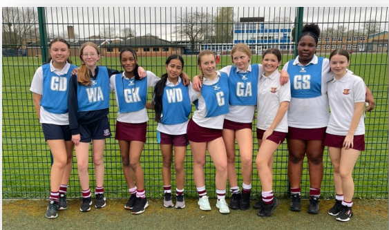
Year 8 girls netball team