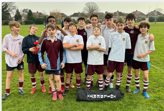
Year 8 boys football team

Well done to the following teams - Year 8 boys, Year 9 girls and Year 10 boys for being the district winners for their tournaments. Again great play from all teams and we look forward to seeing them play again next year!