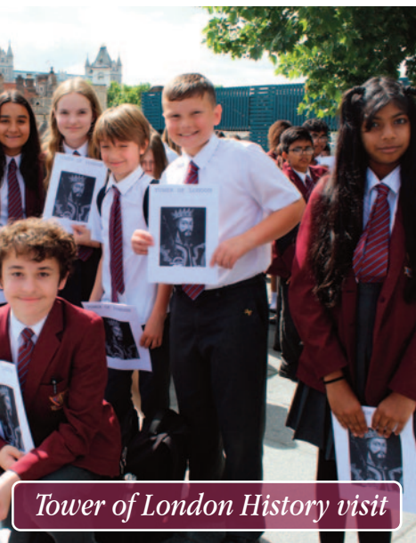
Tower of London History visit