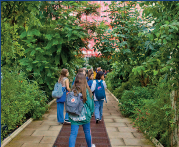
Kew Gardens Art Trip

Education is not just restricted to a classroom! At St. Paul's we recognise that young people need a breadth of experience in order to develop their talents. Year 7 start with a 'Fresher's Week', where they can sign up for a range of activities which run during lunchtime and after school. In all year groups there are opportunities to take part in sports, drama, music, as well as lots of other clubs. We also run a large number of trips and excursions including: Geography Field Trips, Spanish and French Residentials and Exchanges, Year Group Success Trips to places like the Chessington World of Adventures and Brighton, all this alongside our annual Ski Trip.